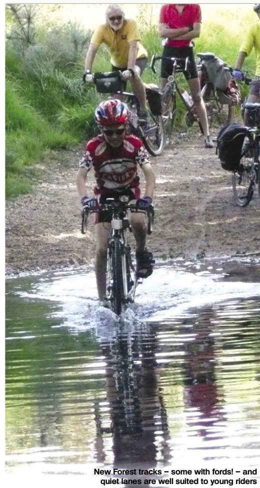
New Forest tracks – some with fords! – and quiet lanes are well suited to young riders

Next year's event runs from 29th July to 6th August. For more details, contact davin_palmer@hotmail.com .